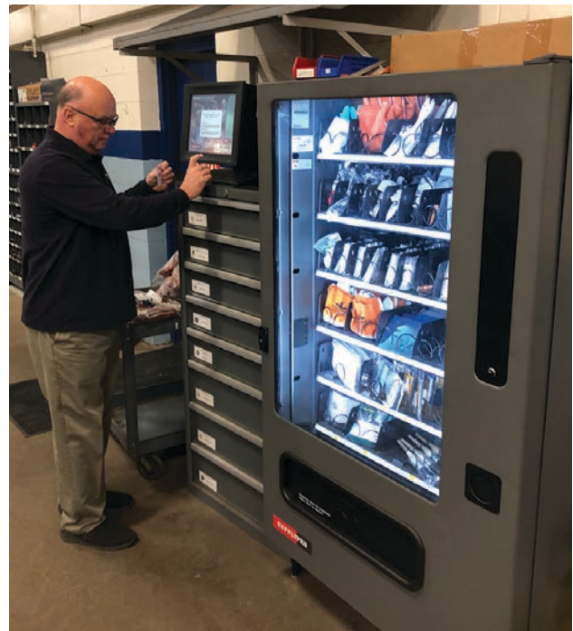
VENDING MACHINES PROVIDE CUSTOMER ACCESS CONTROL AND CREATE ORDERS

through the acquisition of several of their competitors. As they grew, they knew that they needed to reduce the time involved in taking and entering the orders, and improve the accuracy of the orders. This challenged them to adopt new technologies over the years. The technology that they used initially offered some benefits, but they did not rest on their laurels. They have been on a path of continuous improvement with all of their technology.