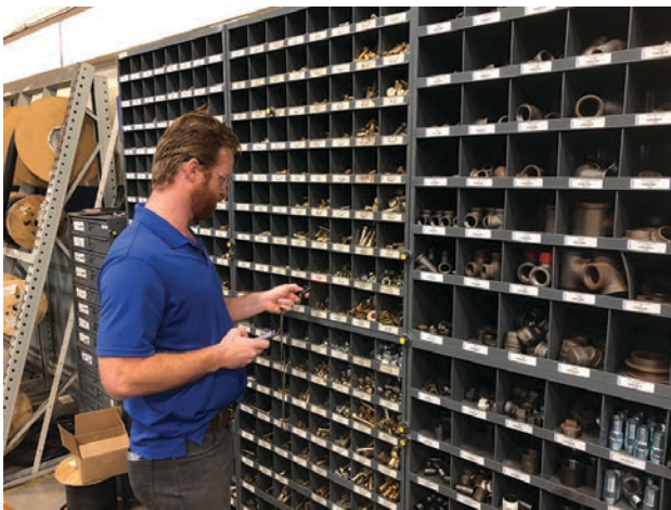
CONVENIENT MOBILE DEVICE BASED ORDERS CAN BE DONE BY USI PERSONNEL OR CUSTOMERS.

The company grew rapidly, both organically, and