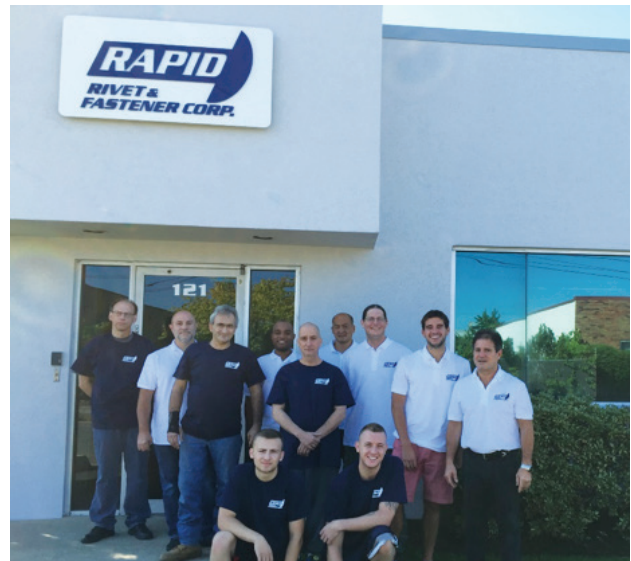
THE FAMILY TEAM AT RAPID RIVET