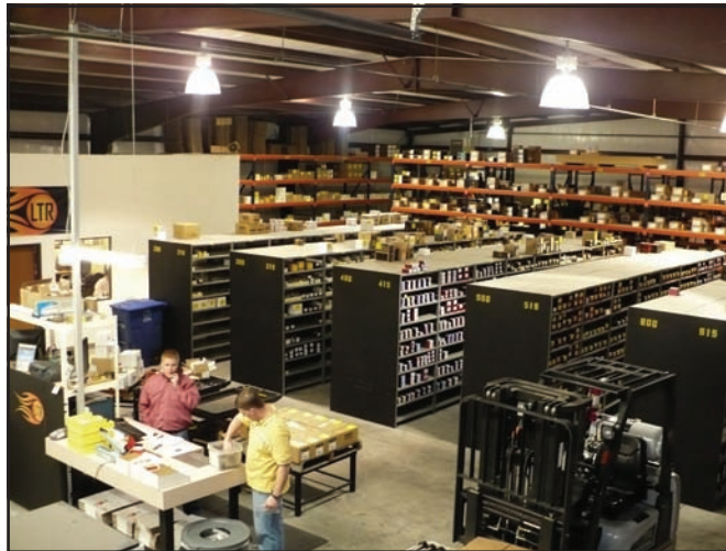
LTR Fastener & Supply Warehouse