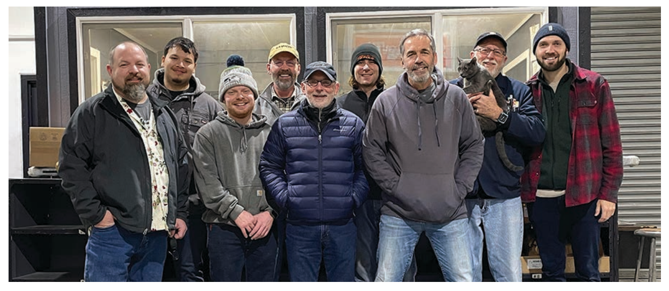
THE CREW AT FASTCO, INC - HERE TO HELP YOU WITH YOUR BOLT, NUT & SCREW NEEDS - GIVE US A CALL!

The Business Edge<sup>™</sup> software, coupled with Computer Insights' fast and friendly support team, helps make Fastco's day-to-day operations run smoothly. At Fastco, we like to sleep well at night, so we do everything with honesty and integrity, even in the little things. Fastco believes this recipe for success will keep them going for many years to come.