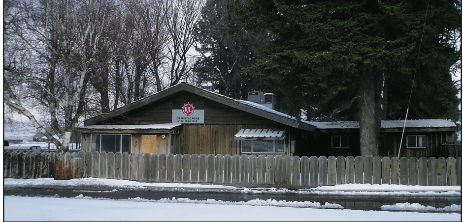
KJL's headquarters, located in Loyalton, California

Reprinted from Distributor's Link Magazine, Spring 2007